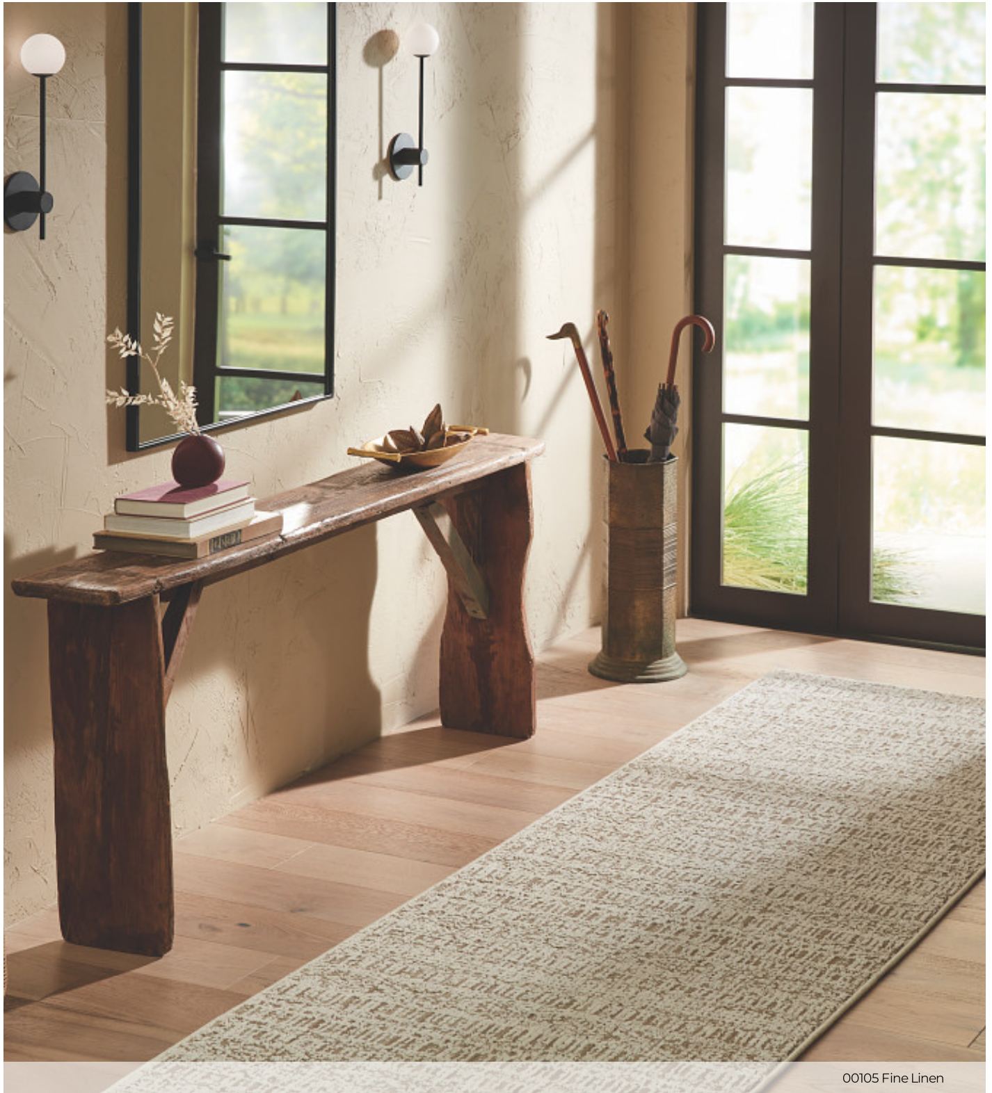
00105 Fine Linen