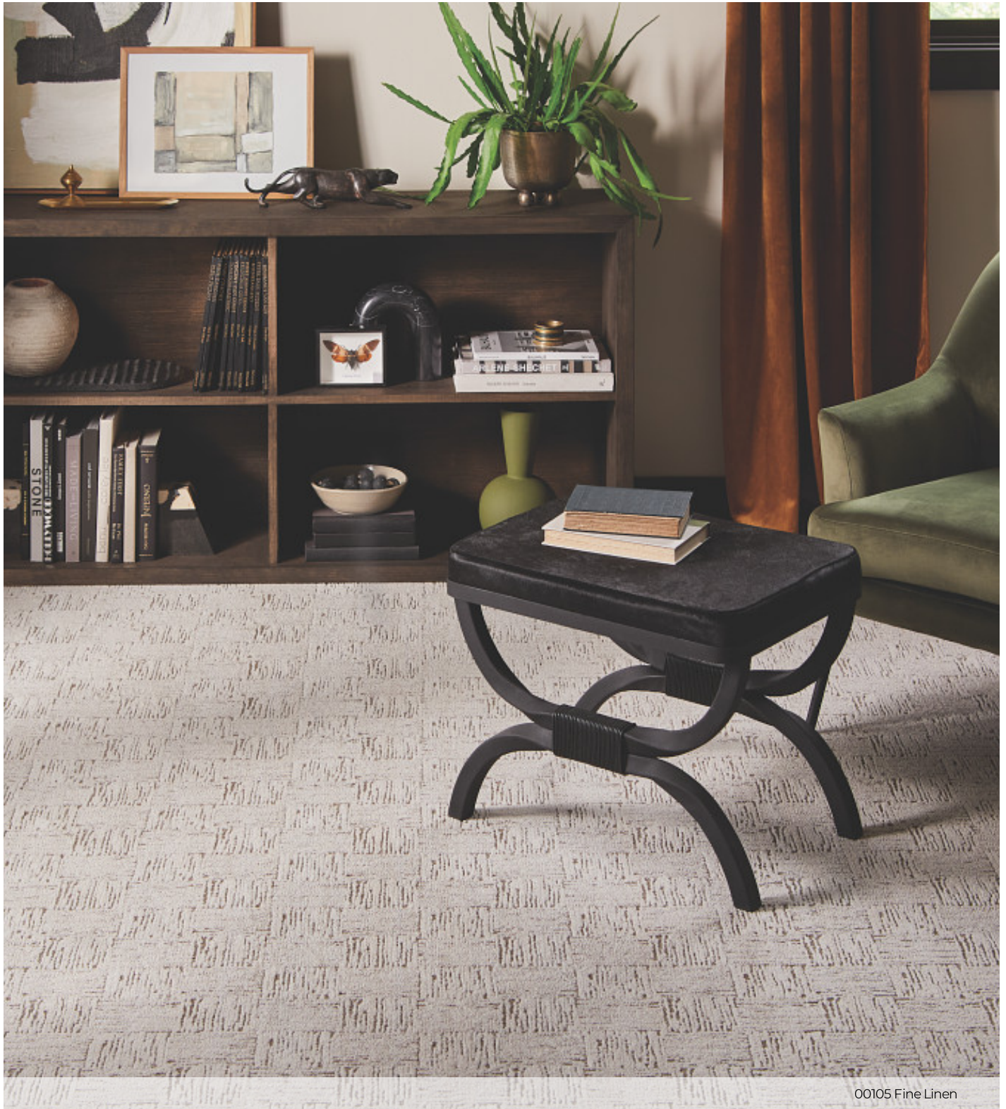
00105 Fine Linen